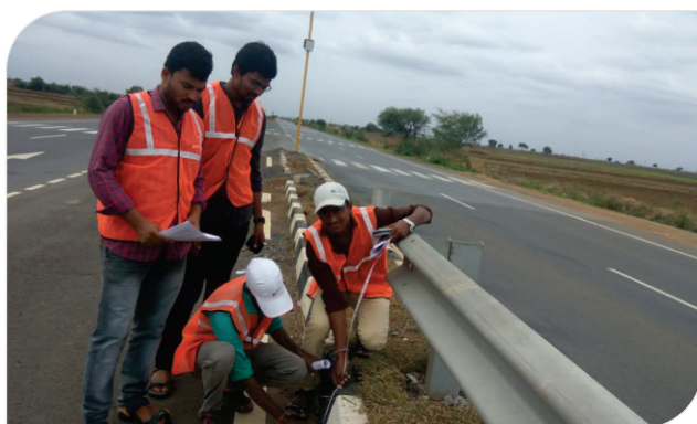
Students doing their live projects on Highway Safety in collaboration with NHAI and RTA

The Department of Civil Engineering, conducted a Road Safety Survey from Nandyal to Chagalamarri (NH-40) from 09 th to 13 th August, 2018. The survey was jointly conducted by NHAI, RTA and IV B.Tech Civil Engineering Students as a part of “Road Safety Measures on National Highways programme” , initiated by the Central and State Governments. The students actively participated in the survey by adopting it as their live project for the B.Tech Curriculum.