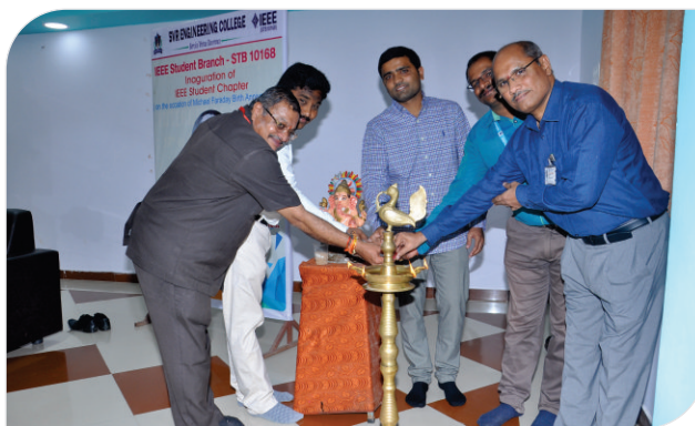
Dignitaries inaugurating IEEE student Branch