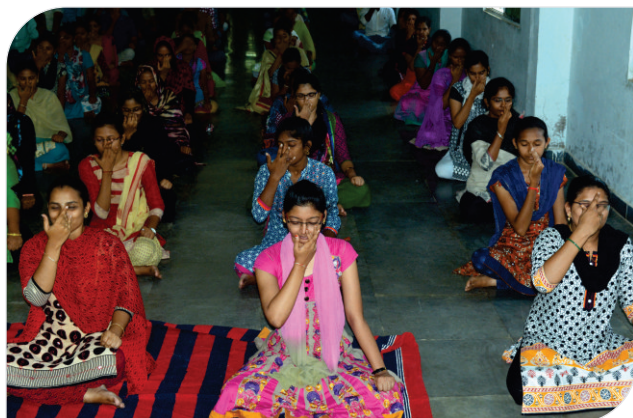
SVREC Freshers' practising in pranayama Asanas