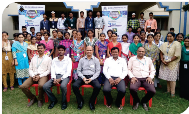
Group photo with vi solutions trainer and APITA

The purpose of the workshop was to bring together electrical and electronics students and stakeholders to learn new software LabVIEW.