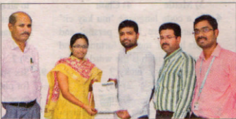
విద్యార్థినిని అభినందిస్తున్న దృశ్యం

నంద్యాల అభివృద్ధి: స్థానిక ఆయత్తులకు చెప్పు నమీవంలేకున్న ఎన్ఎస్ఆర్ సంస్థానికంగా కళాకారుల క్రాంతివేసే ప్రైవేట్ నిర్వహణ కళాకారుల, గురువారం వచ్చినవరకు కుంభం కోవేదించే ప్రసిద్ధి లీవిడే అభ్యర్థులకు నిర్వహించిన ప్లేనమేడేలో కళాకారి విద్యార్థుల నివృత్తిని పెంపిరికి అంది దిక్కునకు, కోడింగో వడర్లులో నివేసిన ఎంబెలెలో మౌనముకు ద్రివి సాధ్యమేకా విఎడిఎల్ వద్దటికి పాల్గొనే ప్రాధునిక ప్రాధునిక ప్రాధునిక ప్రాధునిక ప్రధునిక తెలిపింది, ఈ మందర్సాగా విద్యార్థులని కళాకారి ఎంబె దిక్కున రెచ్చి, త్రిపురంగుల, హెడేడే నమూనెలో, దీక్షేన కోవేదించు అభివృద్ధి కళాకారుల అభివృద్ధిని కళాకారుల కళాకారి ఎంబె దిక్కున మూలముకు కంప్యూటర్ ప్లేనం ఇంజనీరింగో విద్యార్థులకు ఎంబె కుంబులో వచ్చే అవకాశము ఉన్నాయని ప్రసిద్ధియోగం చేసేకళాకారి కళాకారులకు సూచించింది