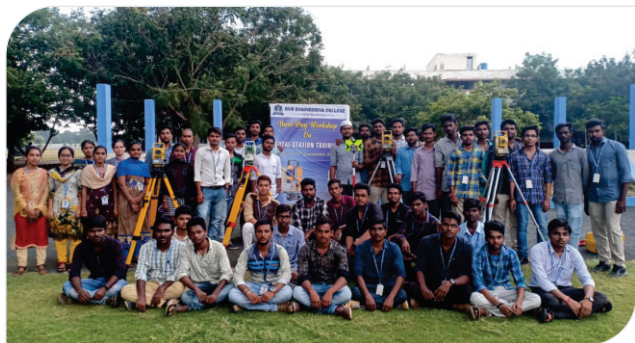
Students on the final day of their training session

The Department of Civil Engineering, in collaboration with CADDPRO Organization (an ISO: 9001-2015 certified company) Organized a three day Training programme on Total Station, from 10 th to 12 th , September, 2018, for all the III B.Tech Civil Engineering students. The training programme provided an opportunity for the students, to learn and get well versed with the operation and application of the latest surveying equipment.