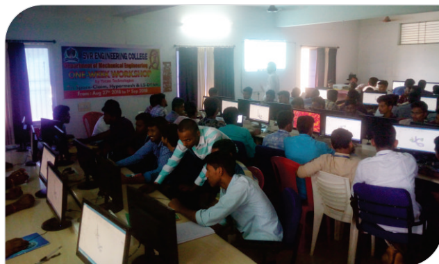
Yucan trainer work together with students

In this work shop students gained knowledge on new softwares like space claim, hyper mesh and LS-Dyna and worked on it. In the companies, by using these types of software, people are designing the models and doing analysis on them directly.