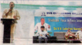
మాట్లాడుతున్న మాజీ జేడీ లక్ష్మీనారాయణ

సీబీఐ మాజీ జాయింట్ డైరెక్టర్ లక్ష్మీనారాయణ