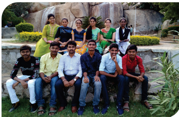
Our Students at ATMOS fest BITS Pilani, Hyderabad