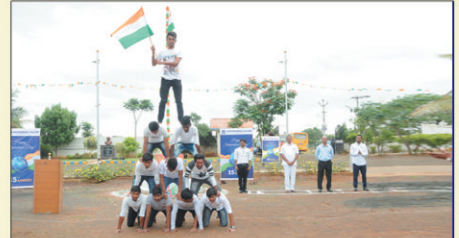
72nd Independence Day