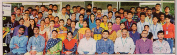
మల్లినేషనల్ కంపెనీ యాజమాన్యాలతో విద్యార్థులు, అధ్యాపకులు

సంద్యాలభర్తలు: విద్యార్థులు చదువులో పాటు దొర్తాడు. నైపుణ్యం పెంపొందించుకొని స్థానం ఎవరితో ఇంజనీరింగ్ కళాశాల క్రీస్తు వీటి వల్లభిస్తున్నది అర్థం. స్థానం క్రీస్తు లో గత మూడు రోజులూ నిర్వహించిన మీ వీటి వల్లభిస్తున్నది ఇవలించు మంగినిని. ఏమీ స్వేచ్ఛ స్థితి దేవాలయము సహకారం నిర్వహించిన కార్యక్రమంలో ఆయన మాట్లాడుతూ, ఏమీ స్వప్న జ్యోతిషపుస్తక సంస్థ ఎన్నో వీటి వల్లభిస్తున్నది కంపె నీలో జరిగిన సీనియర్, ఇంజనీరింగ్ విభాగంలో సాఫ్ట్వేర్ దేవాలయము వలన