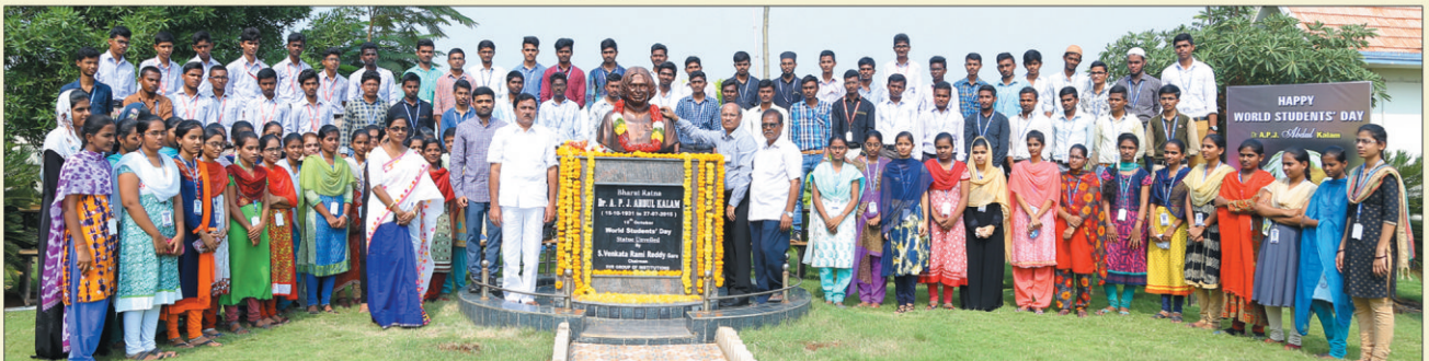
Dr. A.P.J. Abdul Kalam birth anniversary celebrations