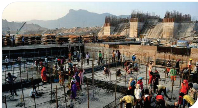
Students witnessing the Mass concreting works at Polavaram Project Site

utility bridges and Amaravathi etc., The students had an opportunity of interacting with the project authorities and enriched themselves with good knowledge and Technology.