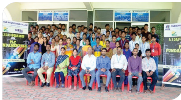
Group photo of the students with all the dignitaries on the last day of the workshop