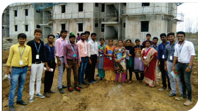
Snap of students in front of Earth Quake Resistant High Rise Buildings

The Department of Civil Engineering, arranged an Industrial visit for all the III B.Tech Civil Engineering students on 24 th August 2018, to the construction site of MHRU located in Nandyal. The students were explained the latest Asian-Aluminium Formwork Technology and also the process of manufacturing Ready Mix Concrete from Batching Plant. The students interacted with the resource persons available on site which helped them update their technical knowledge as per the Industry requirement.