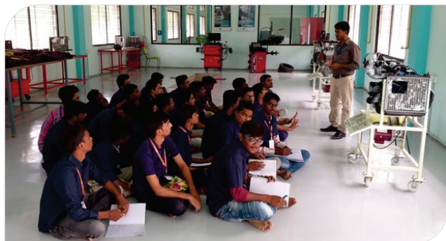
Students on workshop with Siemens excellence mentor

The students gained knowledge on two and four wheeler vehicles by working with fuel system, breaking system, clutch operation, chassis and wheel alignment etc., and also traffic rules.