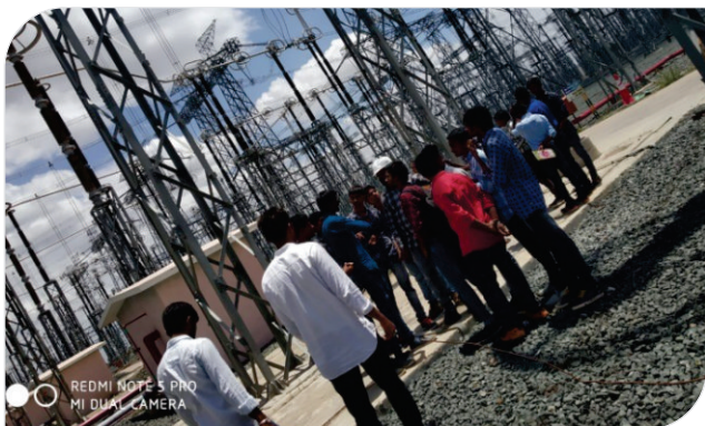
II & III B.Tech Students observing the power grid system at 765/400kV Power Grid, Orvakal, Kurnool District

The Department of Electrical and Electronics Engineering organized an Industrial visit to Power Grid (765/400kV substation) at Orvakal, Kurnool on 08th September 2018. The Students observed the different components of substation like lightning arresters, reactors, relays and wave trap etc.,. The resource persons available on site clarified the doubts of the students and shared their experiences.