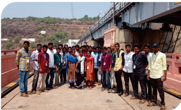
Students at Dam Location

The Department of Civil Engineering, arranged an Industrial visit for all the II B.Tech Civil Engineering students to the Srisaillam Dam and Power House, on 09th March 2018. The students were accompanied by the authorities who took them on a tour and explained in detail, the various structural components of the dam and how electricity is generated in the power house. The students had a practical visualization of their theoretical knowledge and they actively participated in doubt clarification session.