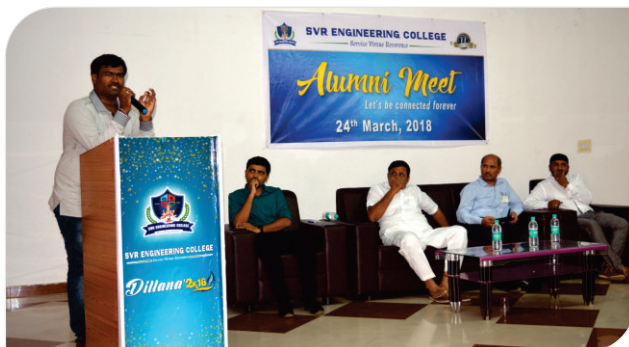
Alumni Meet - 2018