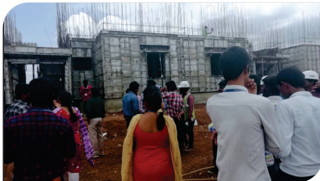
Students witnessing Shear wall Technology

The Department of Civil Engineering, arranged an Industry – Institute – Interaction program for all the IV B.Tech Civil Engineering students on 05 th September 2018, with the resource persons from VASCON Engineers Private Limited. The students were taken to an industrial visit, to one of their construction sites, where they were explained the shear wall technology and Seismic Design of High-rise buildings. The students participated in an interactive session and got all their doubts clarified.