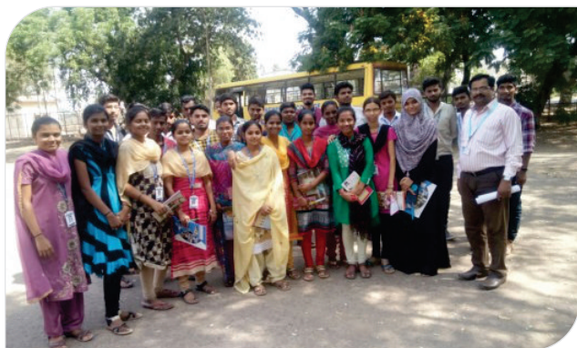
Industrial -Interaction by III E.E.E Students along with H.O.D & Faculty members in Vijaya Milk Dairy.

The Department of Electrical and Electronics Engineering organized a technical field visit to Vijaya Milk Dairy, on 21st April, 2018. The purpose of the field visit is to provide the students a practical visualization of their theoretical Knowledge, on various types of generators, steam injection systems, steam infusion systems, plate heat exchangers, tubular heat exchangers, and scraped surface heat exchangers.