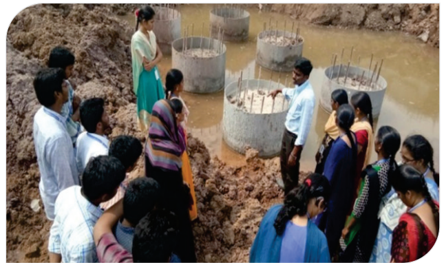
Resource person explaining Pile foundations

The Department of Civil Engineering, arranged an Industrial visit for all the III B.Tech Civil Engineering students to the ROB site, on 09th February 2018. The students were accompanied by the engineers from KMC Constructions, who explained in detail the methods of Prestressing, Pile Driving for foundation and Casting of bridge girders. The students acquired good technical knowledge on various technical aspects related to the construction of Railway Over Bridge.